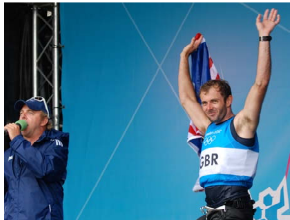
Nick Dempsey at Weymouth just after the medal race.

The best ever Olympic medal for a GB windsurfer. Nick Dempsey, who has his roots in Norfolk, put in a fantastic performance to win Silver medal in the final race at Weymouth. The only sailor to swim across to the Nothe spectator area to celebrate with his supporters. A fantastic result and a real credit to the windsurfing community.